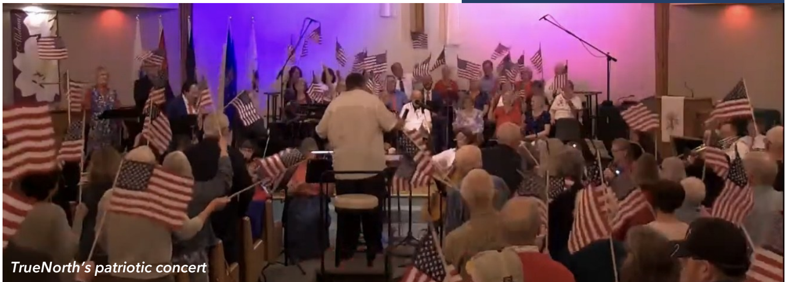
TrueNorth's patriotic concert

Worship honors and glorifies God and cultivates a deeper relationship with Him. It is a way of living—a daily practice—within our faith. May this summer provide ample opportunities to share His love, celebrate His teachings, and grow in faith.